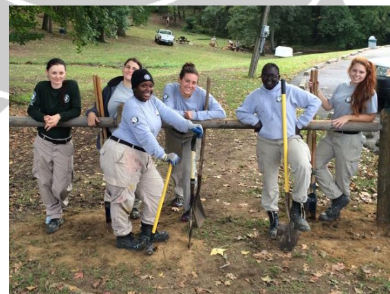
An AmeriCorps team working in T.O. Fuller State Park in October 2014.

Much like the CCC, team members receive a set stipend ($4,000 for 10 months), uniform, meals, and housing. In recent years Shelby county has had several AmeriCorps teams working in the Southwest Memphis area.