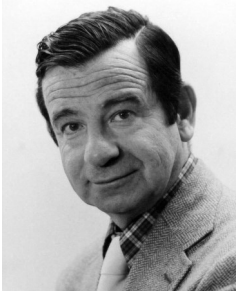
Walter Matthau, Actor