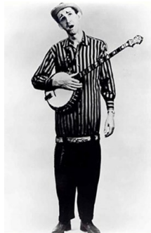
David "StringBean" Akeman, Singer & Comedian